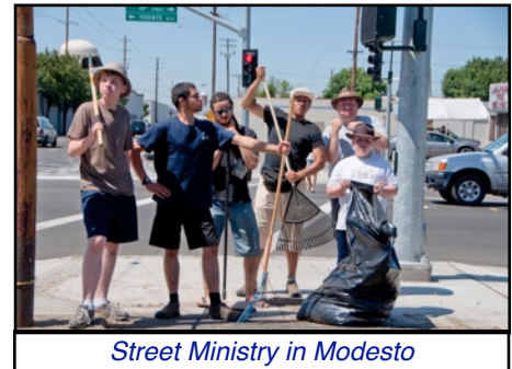
Street Ministry in Modesto